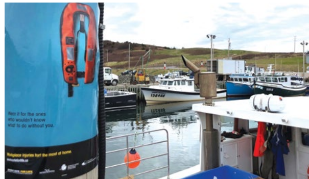
The fishing sector's injury rate has improved 20 per cent over the last six years.

WCB Nova Scotia sent a message to captains and owner-operators of lobster boats ahead of the season opening. We wished them and their crews a successful season and provided some important safety reminders, complete with a safety checklist. Fishing in Nova Scotia is safer than it has ever been, thanks to work led by WCB in partnership with government and industry safety leaders.